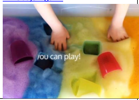
Design and create your own Easter Bonnet hats.

https://www.youtube.com/watch?v=Bobuj5Mgd7A