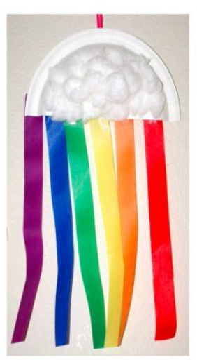
Tissue Paper Streamer Rainbows are always a huge hit with kids of all ages! Easy enough for toddlers, but cute enough that the big kids always want to make them, too!

Design a rainbow window hanging. Make sure the colours of the rainbow are in the right order. Red-Orange_Yellow_Green_Blue_Indigo _Violet. If you have a CD or DVD pick it up and look at the shiny side-Can you see the rainbow? Fill a clear glass with water, and put it on plain white paper. Use your mobile phone torch to shine a light through the glass. Can you see a rainbow? Where else do you see rainbows?