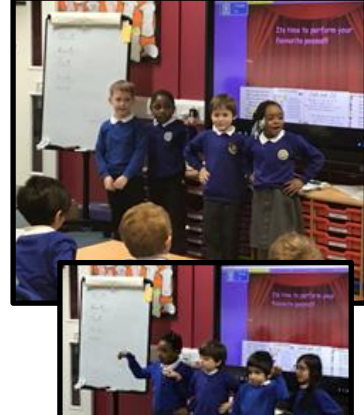
Performance poetry in Year 1