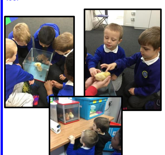
Busy days in Reception and our chicks hatched too!