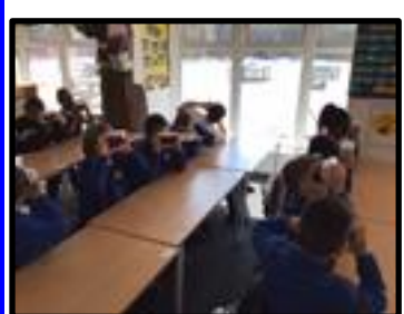
Virtual Reality Space experience in Year 5