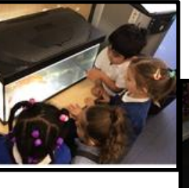
Welcoming the new fish in Nursery