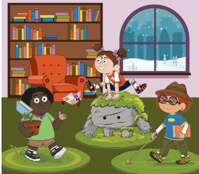
Story Garden illustrations by Dapo Adeola, illustrations and logo © The Reading Agency 2025