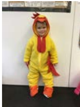
Toddler Room winner