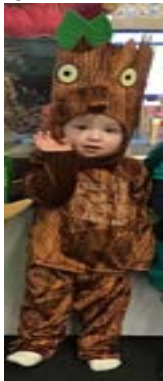
Baby Room winner